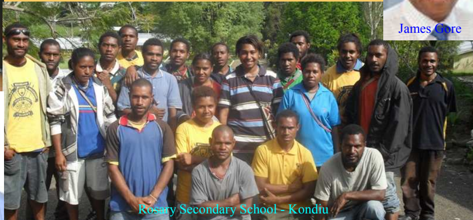
Rosary Secondary School - Kondiu