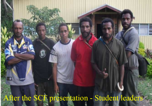
After the SCF presentation - Student leaders