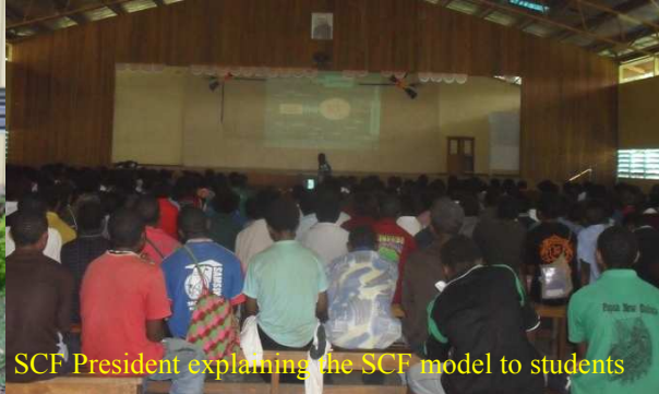
SCF President explaining the SCF model to students